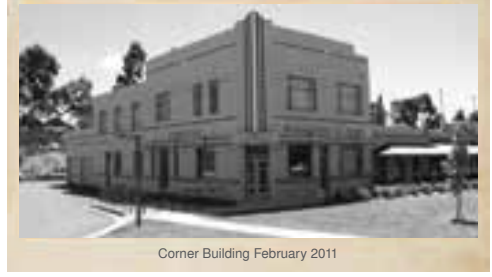
Corner Building February 2011